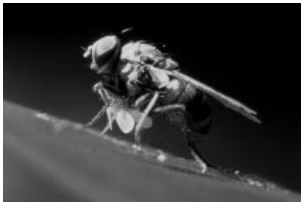
Fig. 2. Coenosia strigipes Stein with an adult fungus gnat as prey.

Six different Coenosia species occur naturally in German greenhouses, and C. attenuata , C. humilis and C. strigipes have been chosen for mass rearing. C. attenuata is assumed to have been introduced with young plants from southern Europe (Fig. 1). It attracted attention because Euphorbia pulcherrima infested with it remained nearly free from whiteflies and fungus gnats without the necessity of chemical and biological pest control measures (7). A three-step rearing method for Coenosia has been developed using sciarid flies (Sciaridae) as feed. The sciarid fly Bradysia paupera was propagated with the help of a nutrient fungus ( Fusarium spp.) on a wood fiber substrate, a technique used for the first time.